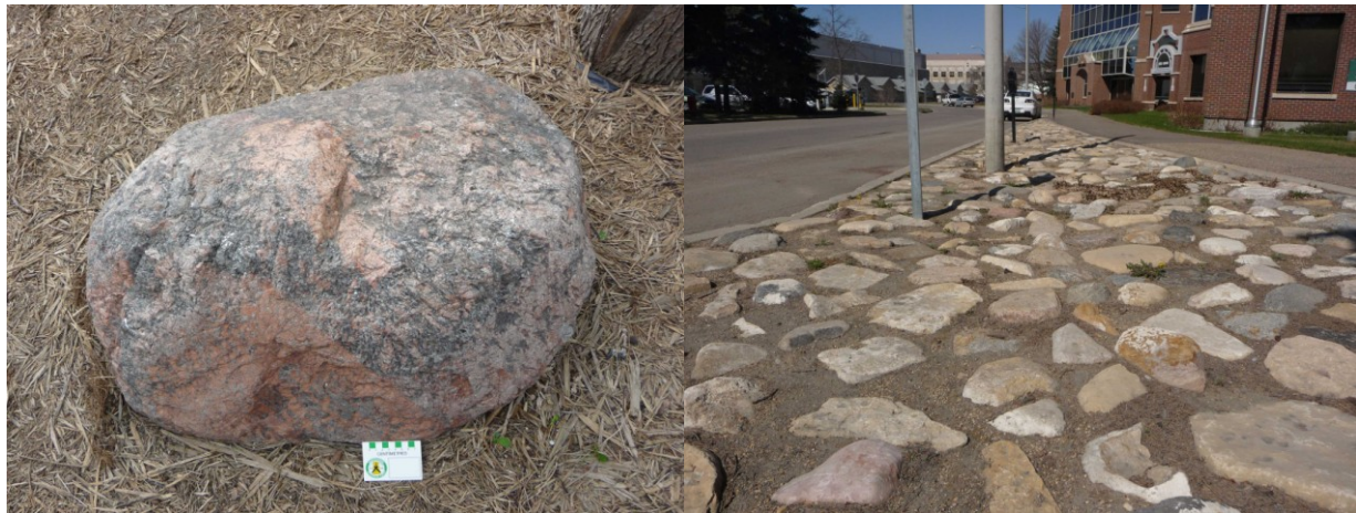
Figure 2 - A typical individual boulder (left) and a typical group of boulders (right) found on campus.

One side of the brochure includes the campus map itself, with the boulders to be used for each of the “Geo-walks” identified by number. The “Geo-walks” are shown by different coloured lines on the map, and are designed to start and finish at the Natural Sciences Museum in the Geology Building. A photograph and simple description of the geological features of each of the numbered boulders are provided. The other side of the brochure was used to provide information about Geology and the Department of Geological Sciences, partly as a promotional tool. In addition, information is provided on how to use the map, a summary of the “Geo-walks” and building stones on campus, and a glossary of geological terms. With such a large amount of information to be displayed it was important to develop an appealing layout that efficiently used the available space.