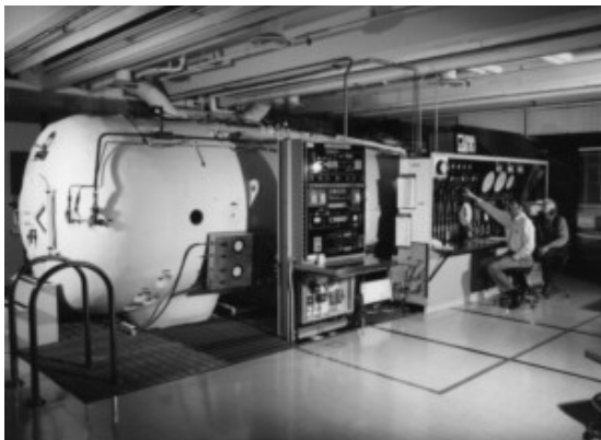
Figure 1: Altitude/dive chamber at SFU.

aerospace physiology testing. The Earth, Ocean & Space Environmental Operations Simulator (EOS) 2 facility provides the infrastructure to facilitate research and development in critical areas for human-crewed exploration missions, including ISS, lunar, Lagrange-point, Near-Earth Asteroid, and Mars system (surface and moons) destinations.