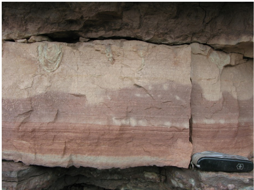
Figure 2: Weakly bioturbated sandstone with parallel lamination and Diplocraterion ichnofossil at upper left.