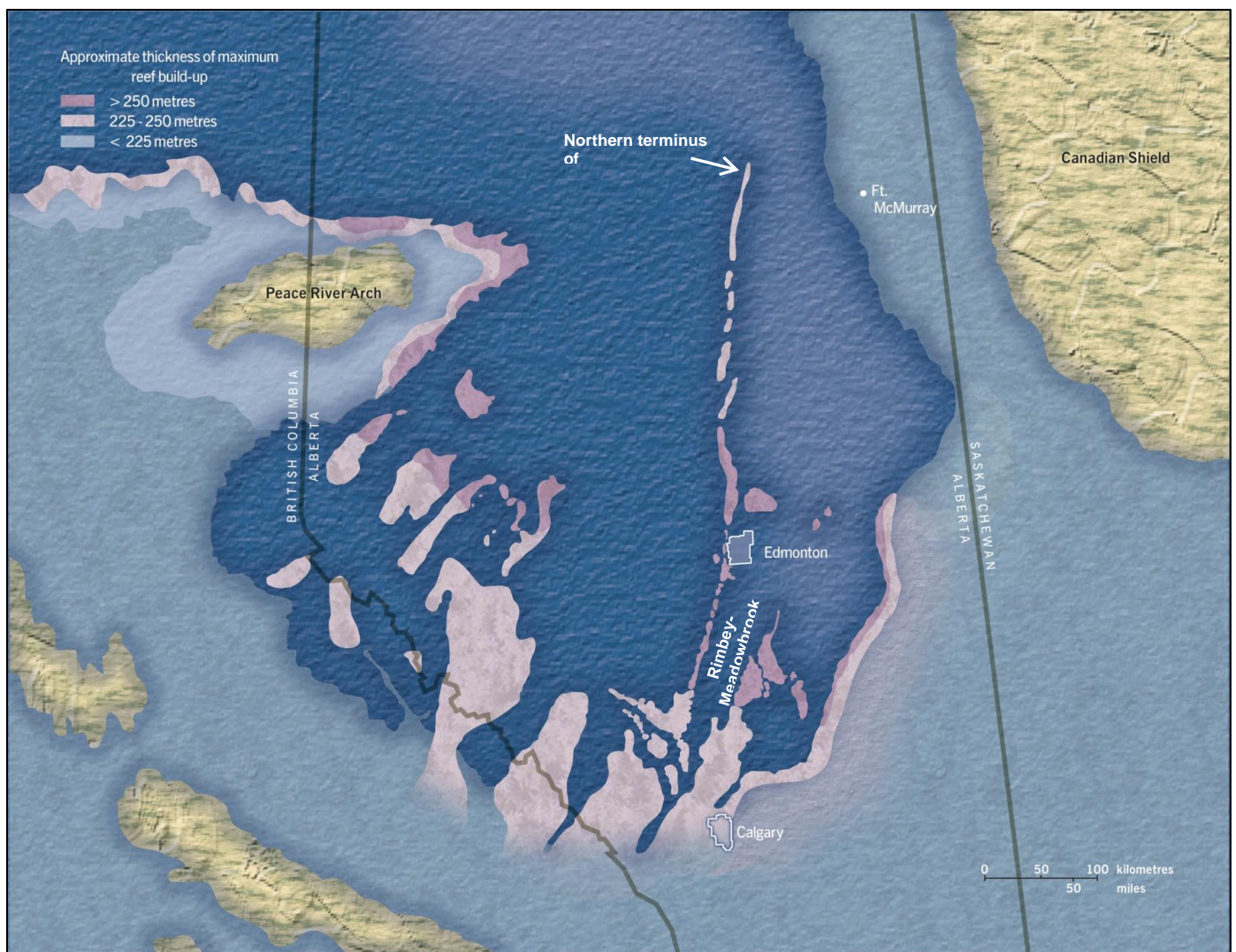
Figure 1. Devonian Paleogeographic Map

The Leduc reefs in south-central Alberta have been studied since the Leduc-Woodbend field was first discovered in 1947. The conventional light oil fields make an excellent analogy for the bitumen bearing Leduc reservoir northwest of Ft. McMurray because the reef trend is on strike with the Rimbey-Meadowbrook reef trend. However, there are some differences. First, the Leduc Formation in northeastern Alberta is a single continuous reef complex. Second, it has been eroded and exposed to meteoric water, and karst related dissolution and fracturing has greatly enhanced the reservoir properties such as porosity and permeability. Third, biodegradation of the oil has converted a light 40° API oil into a heavy 6° to 8° API bitumen. Quantifying and predicting the reservoir properties by integrating the geological and geophysical information is the first step in recovering bitumen from this carbonate reservoir.